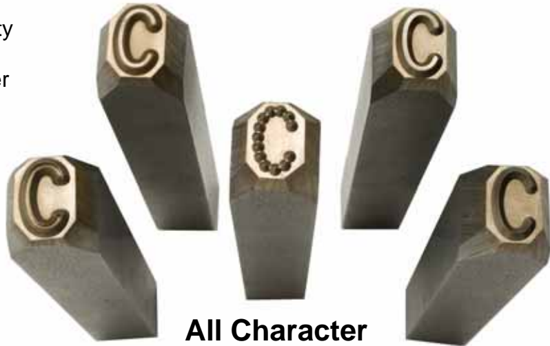
All Character Face Styles