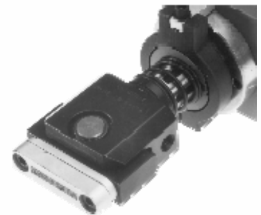
Floating Holder Adapter and Retainer