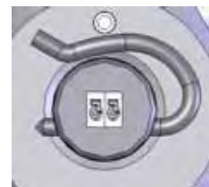
Rod Style A