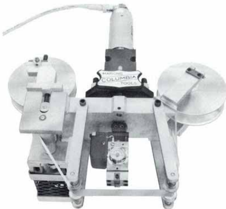
Columbia 912 with a foil feeder.

For use with model 911, 912, and 914 automation units.