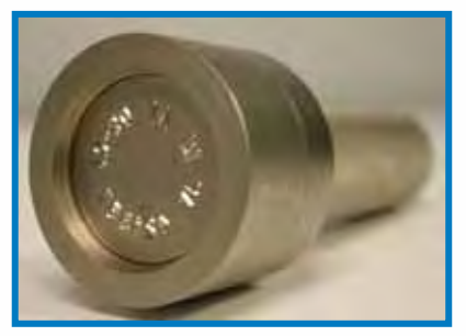
Radially Engraved Shank Style Dies. Used in a press when a radial impression is desired on a flat surface.