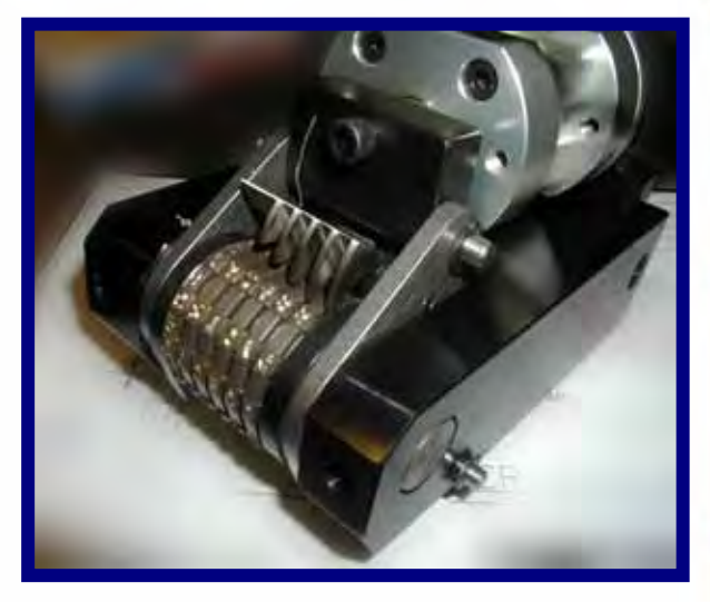
Model 123K shown with Actuator

Styles: 130K for manual changing of the numbers, and 123K for automated incremental serialization of the numbers